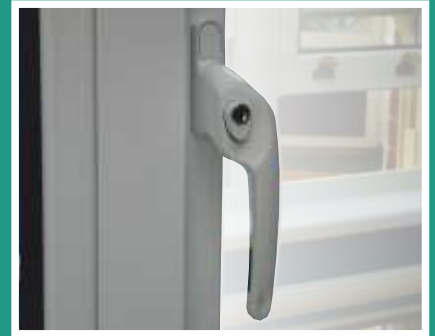
Conventional Espag Handles