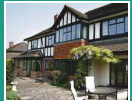
Over 200 Different Colours