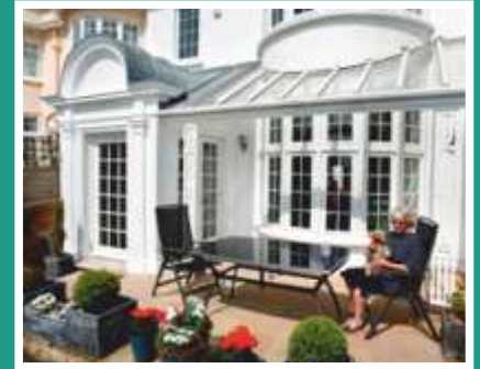
Bay Windows & Conservatories