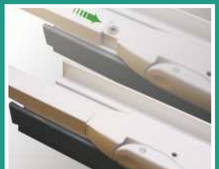
Concealed Handle Fixings Under Glazing Bead For Added Security