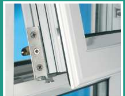
Side or Top Hung Casements