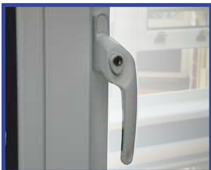
Conventional Espag Handles