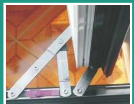
Easy Clean Friction Hinges