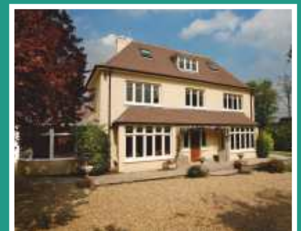
Many Styles And Designs