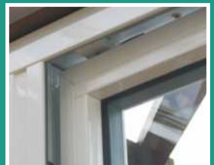
Secure Night Vent Facility