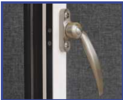
Brushed Steel Look